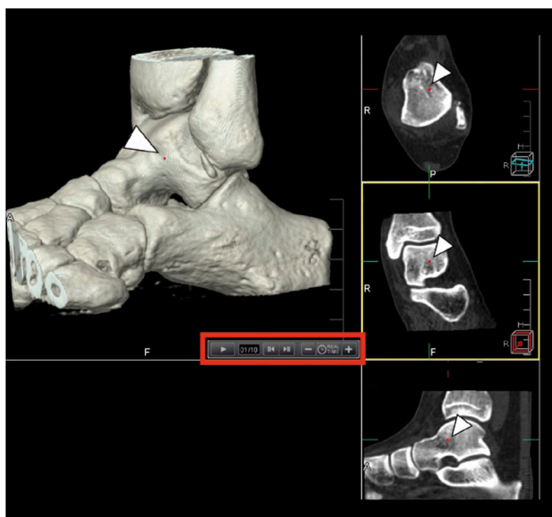
Figure 1: Bone locking procedure. A seed is placed in the medullary cavity of the bone to be locked (arrowheads). Position can be checked in both volume rendered and multiplanar images. Note the time controls (red square) allow browsing through all the volumes loaded.

Bone locking was possible in all cases and improved visual analysis markedly, by reducing the influence of through-plane motion. In our opinion, the use of a static reference for motion analysis allows a better appreciation of the amplitude of the target motion and improves the analysis of each individual moving bone.